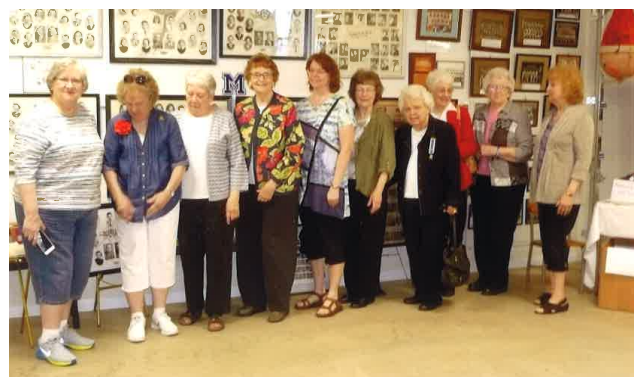
Historical Society welcomes the DAR group