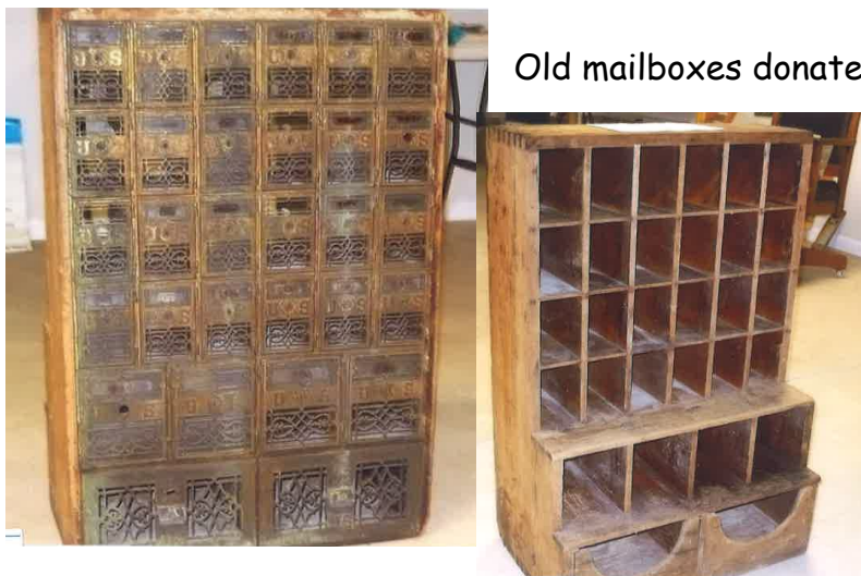
Old mailboxes donated by Wade Berger